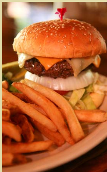
An 8oz Blarney Burger

To further enhance the taste, we hand patty all our burgers, thus ensuring the burger holds the beef juices and spices, giving it a fuller favor.